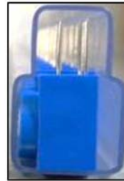
New Tube Packaging