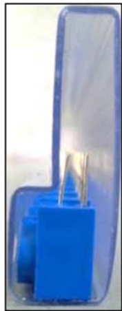
Old Tube Packaging

There is no change to the model's form, fit or function. The only changes are to the dimensions and shape of the tube packaging for the model.